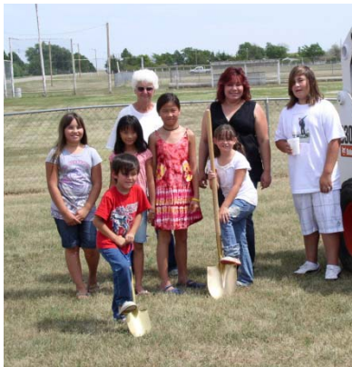
A group of skateboarding enthusiasts breaking ground for the skateboard

The dream of a skateboard park for the youth in the White River area finally became a reality. A group of youth calling themselves “The Lords of Prairie Dogtown” began their dream in 2007 of finding a safe place to skateboard in White River. This group started making the public aware of their desire for a skateboard park by carrying their skateboards and signs through a local parade. The signs read “We need a skate park” and “Help us get a safe place to skate”. They gathered over 200 signatures from the local citizens in support for their project. The group began their fundraising efforts by setting out donation jars, holding hip-hop concerts, hosted a Halloween haunted house, held rummage sales and set up concession stands at local events. In February 2008, the group partnered with the South Central RC&D council who provided technical assistance in applying for several grants. As funds became available, work began on the skate