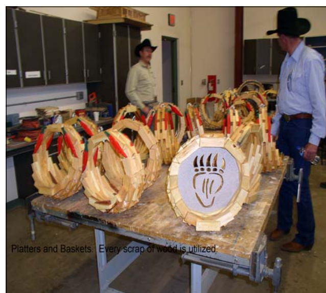
Planters and Baskets. Every scrap of wood is utilized.

This includes planters for community gardens like one at the Hondo Senior Center.